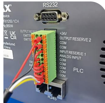
Controller PLC Socket