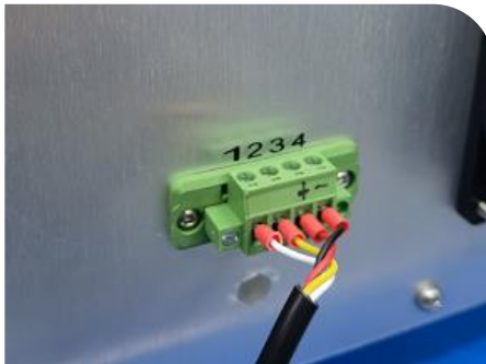
Light Shield Box