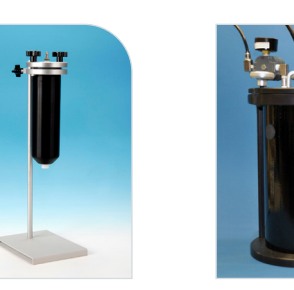
Bottle Drop-In Reservoir