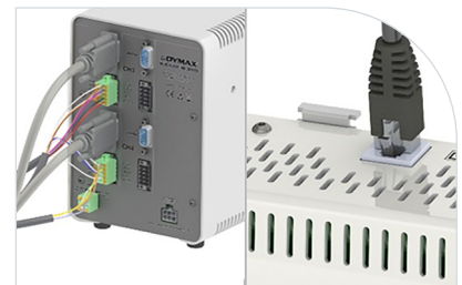
From this wiring