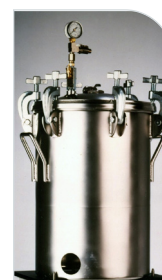
Pail Drop-In Reservoir