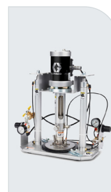
Mini Ram Pump