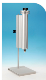
12 oz (300 mL)