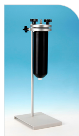
20 oz (550 mL)