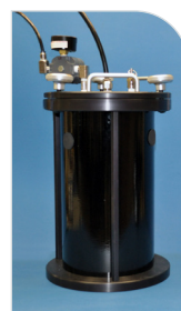
Bottle Drop-In Reservoir