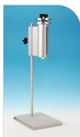
6 oz (160 mL)

*KFM (fluoroelastomer) seals are not compatible with UV-curable adhesives