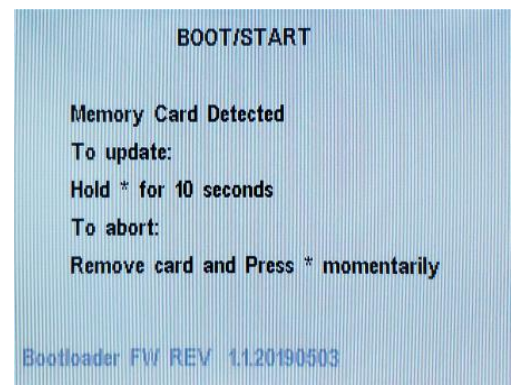
Figure 2. BOOT/START Screen

7. Push the rotary push-button for 10 seconds, until the screen in Figure 3 appears.