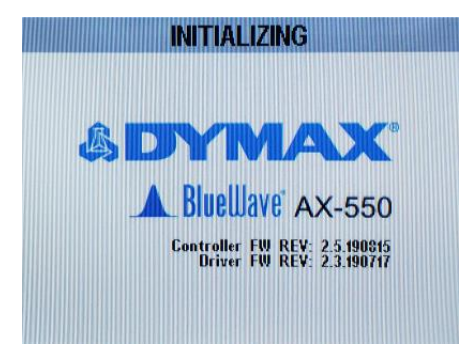
Figure 4. Firmware Upgrade Successful